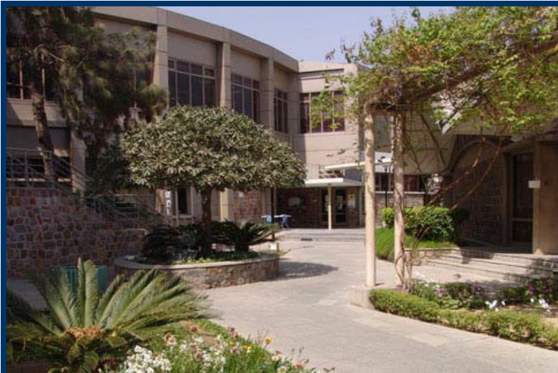
AIS/AES Alumni Association, Inc. January 2010 Newsletter