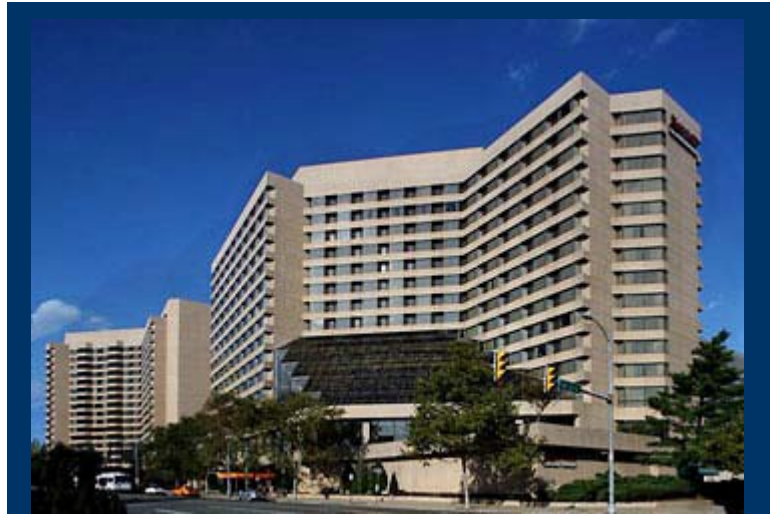
Gateway Marriott Hotel 1700 Jefferson Davis Highway Crystal City (Arlington), VA 22201 USA

Those of us who stayed at the hotel during the last reunion were very pleased by the accommodations and by the professionalism of the hotel staff. We felt this was the perfect spot for gathering again with our AIS/AES friends!