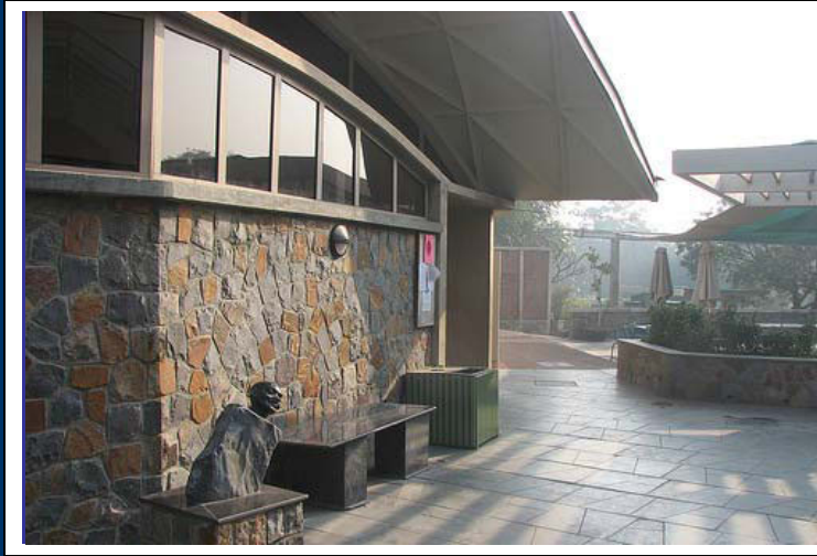
AIS/AES Alumni Association, Inc. March 2010 Newsletter